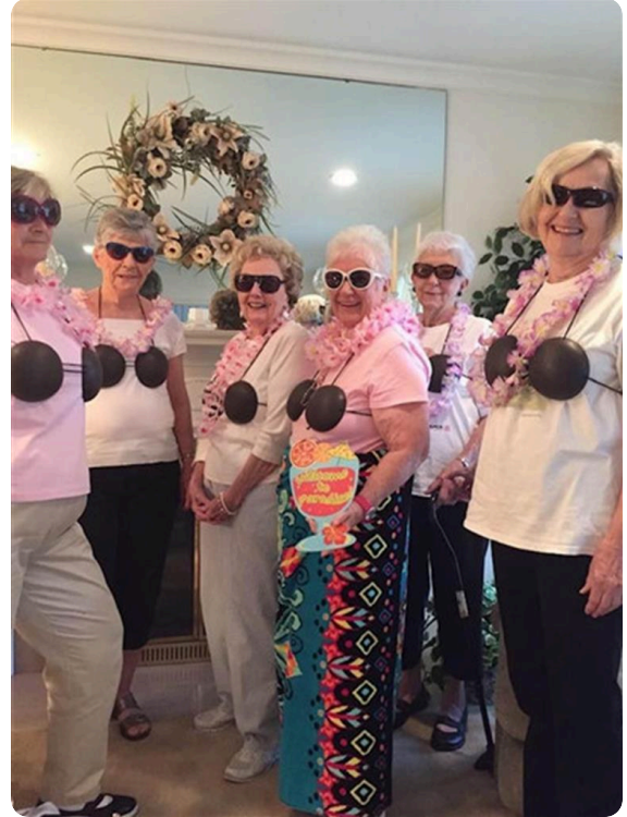
All these that I added are my mom's pictures of the domino girls pre-Covid.